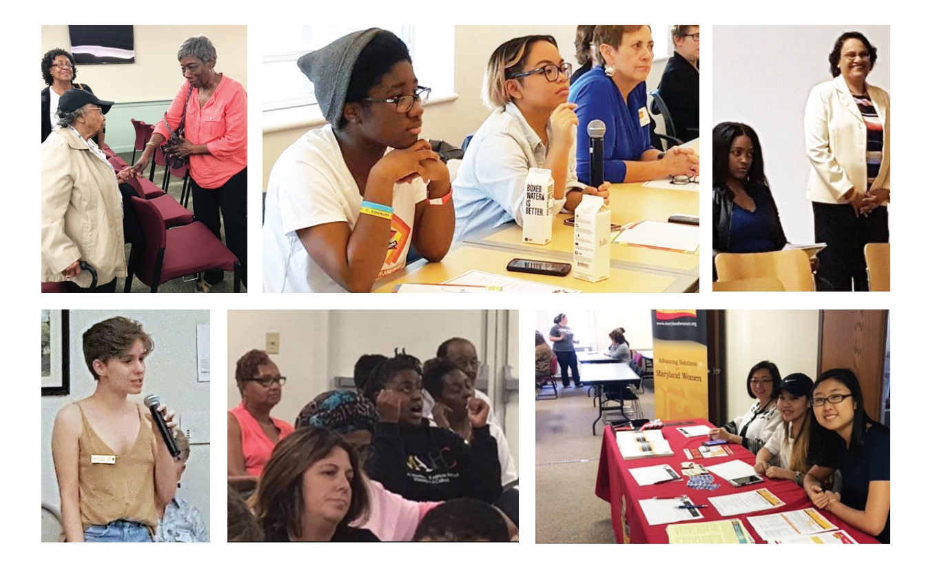
Table 3 lists the top issue from each of the forums, further illustrating the variety of issues that women believe to be important.

Participants in the forum held in conjunction with the Women of the World festival at Notre Dame of Maryland University also noted an educational issue as the top concern: weaknesses in the educational system that impact girls disparately, including lack of STEM preparation for girls.